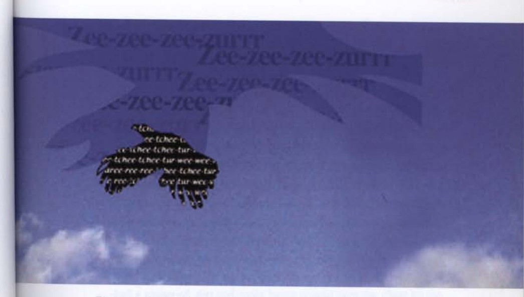
Figure 4. Screen shot, Birds Singing Other Birds' Songs

In Mencia's Things come and go ..., 35 digital projection showed an animated calligramme composed of pieces of paper inscribed with letters moving through the sky, initially legible as a poem about the ongoingness of things as they come into being, change, and go, a process humans resist as they attempt to hold onto them. As the calligramme shifted and reformed into new shapes, the initially coherent phrases of the poem were broken and reconfigured while a computerized voice articulated the changing configurations. In her documentation of the work, Mencia comments that "the spectator can either love or hate" this voice, or accept it as it moves "from one state to another."36 We may wonder if her comment about hating the voice reflects feedback from spectators who found the work frustrating because they yearned for the durably inscribed marks of print that have the decency not to mutate while one is reading them.